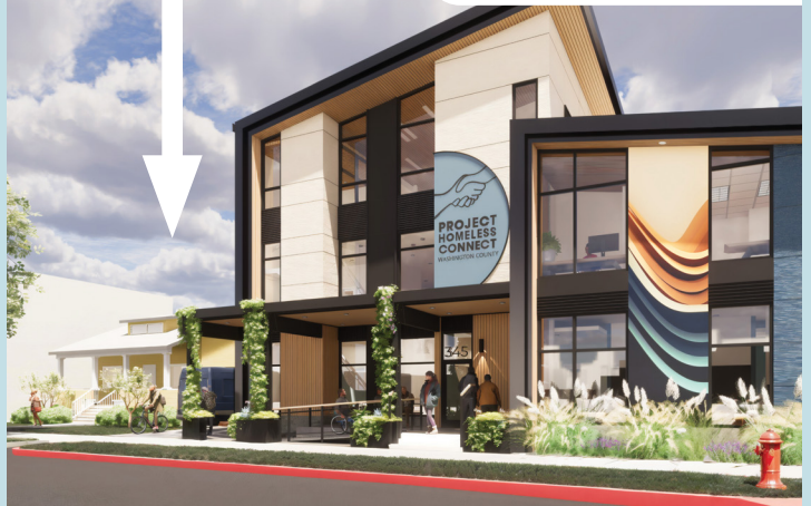
New Access Center 12,000 SQ FT

The New Access Center will be a purpose-built, welcoming space designed for connection, support, and stability. Built to meet real needs.