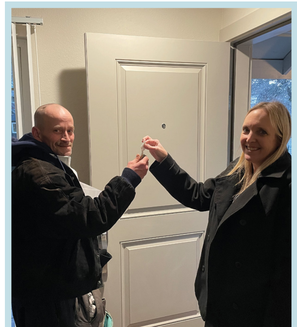
Move in day! A friend from PHC receives the keys to their new apartment.

Your support is more than a contribution. It is an investment in what works and a turning point for how our community responds to homelessness.