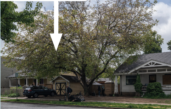
Current Access Center 1,600 SQ FT

The current space is cramped, makeshift, and over capacity. Guests wait outside. Dignity and privacy are hard to come by.